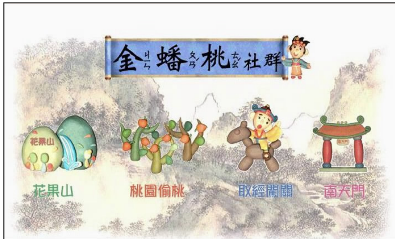
Figure 3. Gold Peach Entrance

After logging in the community, the child users could play roles as Magic Monkey, Pig, Sandman, Dragon Horse or other genius etc. They could follow Master Monk to break in 81 forbidden area that were controlled by different monsters and demons. They could steal Gold Peach to surf the WWW to find out the answers for their questions. Or, they might join one of parties in Flower Island where they could chat or work out a task